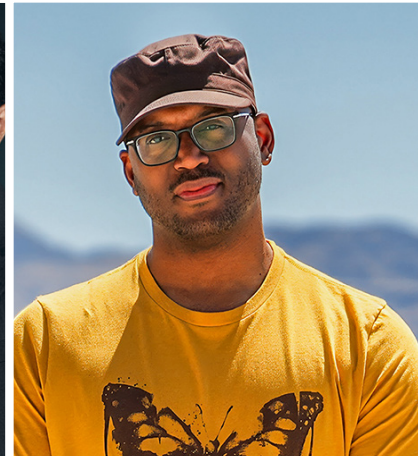
HUMAN FOOTPRINT, SEASON 2 25 WEDNESDAY AT 8:00PM