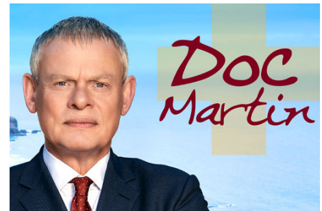
DOC MARTIN SUNDAYS, BEGINNING JUNE 15

7:00 Antiques Roadshow: New York City, Hour 1 8:00 Antiques Roadshow: New York City, Hour 2 9:00 The Roosevelts: An Intimate History (Pt. 4 of 7)