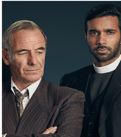
GRANTCHESTER ON MASTERPIECE 15 SUNDAY AT 8:00PM