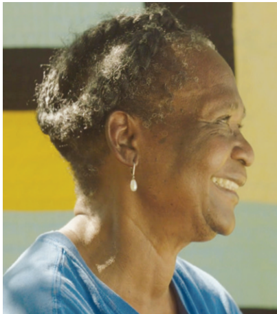
THE QUILTING WOMEN OF GEE'S BEND 3 TUESDAY AT 8:30PM