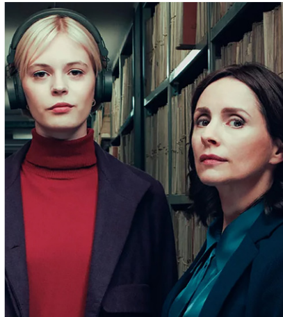
PATIENCE 15 SUNDAY AT 7:00PM