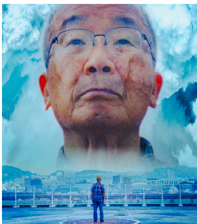
ATOMIC PEOPLE 4 MONDAY AT 9:00PM