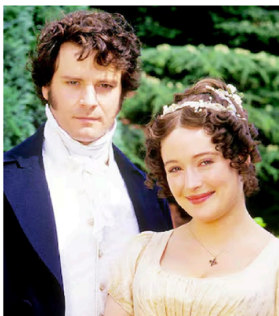
PRIDE AND PREJUDICE 10 SUNDAY AT 6:00PM