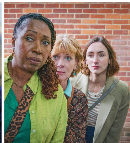
MARLOW MURDER CLUB SEASON 2 24 SUNDAY AT 8:00PM