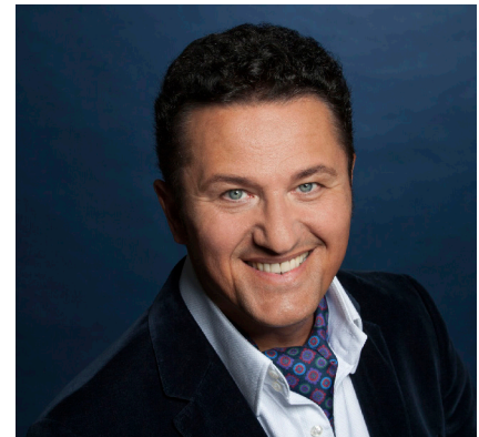
GREAT PERFORMANCES: VIENNA PHILHARMONIC SUMMER NIGHT CONCERT 2025