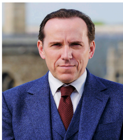
PROFESSOR T SEASON 4 24 SUNDAY AT 7:00PM