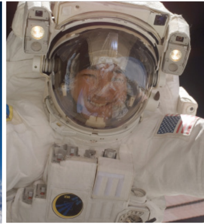
ONCE UPON A TIME IN SPACE 14 TUESDAY AT 8:00PM