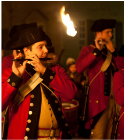
AMERICA – MADE IN VIRGINIA 250 YEARS TOGETHER 5 SUNDAY AT 5:00PM