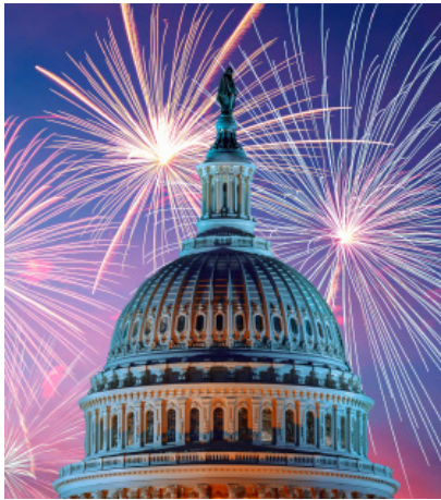
A CAPITOL FOURTH: 250TH WEEKEND CELEBRATION 3 FRIDAY AT 7:00PM