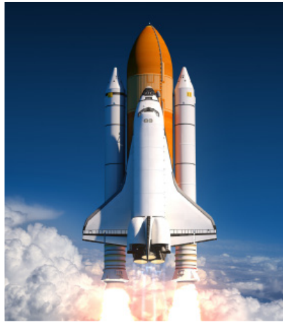
WHEN WE WERE SHUTTLE 6 MONDAY AT 9:00PM